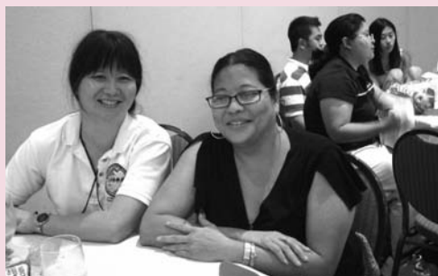
Folks enjoying the luncheon