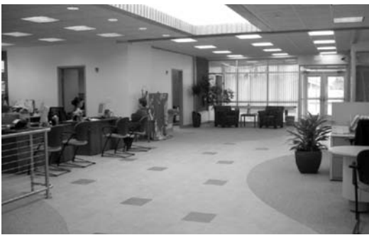
New lobby area